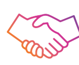
Partnerships in & Beyond the Field