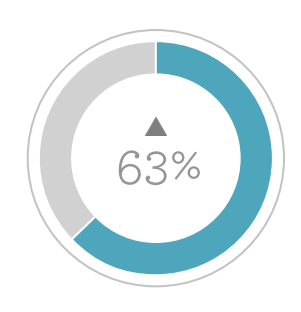
GFE's OST Funder Network members' interest in program quality is growing: in 2013, 63% reported they were funding evaluation and quality assessment at a systems level, up from 47% in 2008.

The stakes for successful OST programming, then, are high. But as OST becomes an increasingly crucial component in education reform and youth development, how will philanthropists, taxpayers and parents ensure that their investments produce desired youth outcomes? How will the field garner enough public and private support to serve the estimated 19.4 million children whose parents could not find an OST program in 2014? The answer is the same as the one recently noted by New York Times columnist David Kirp as he compared the results of various early education programs in an op-ed: The difference between poor and positive outcomes is "in a word, quality." <sup>3</sup>