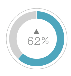
As of 2015, 33 states had adopted afterschool quality standards. A Wallace Foundationcommissioned report published in 2013 found that 62% of cities coordinating afterschool programs use quality standards or a quality framework.

The following list of components of a high-quality OST system was informed by the work of the Forum for Youth Investment, National Institute on Out-of-School Time, National Afterschool Association, Every Hour Counts, statewide afterschool networks, the Afterschool Alliance, the Harvard Family Research Project and others.